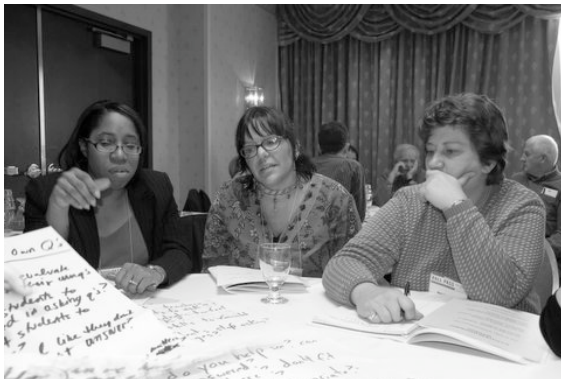
Teachers from around the world participate in a RQP workshop at the Coalition of Essential Schools Fall Forum in Boston.

Participant evaluations revealed that teachers learned a "very practical" method that they could "use on Monday," something that could "really open up and breathe some life into [their] teaching" and "give everyone a voice" in the classroom. Teachers were eager to share what they had learned with their students and with colleagues.