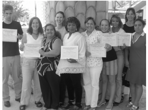
Participants in an RQP voter education workshop in Arizona.

"Now we feel more comfortable and more confident that we can make better decisions."