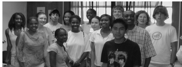
Students in Greensboro used RQP methods to focus on high school dropout rates.