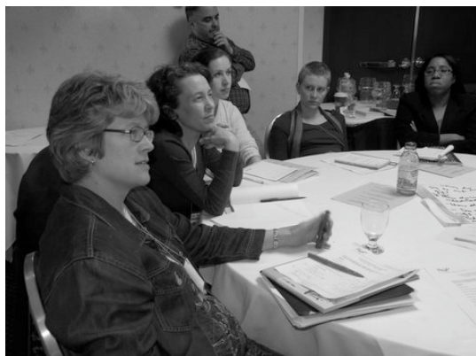
Teachers participate in an RQP workshop at the Coalition of Essential Schools Fall Forum. See story page 3.